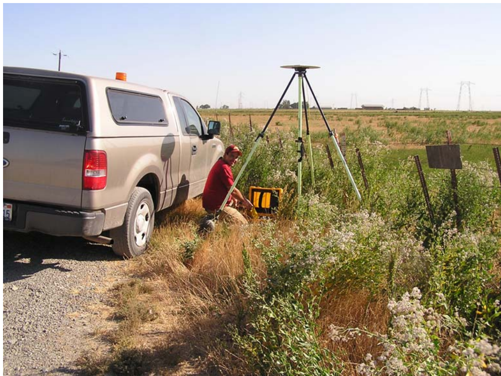
Jim Frame, Frame Surveying & Mapping