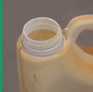
Handle and neck stained but clean