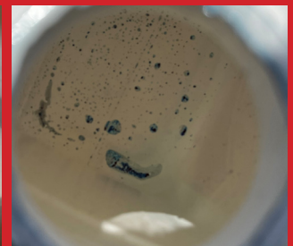
Bottom caked with dried residue

PO Box 1928, Apex, North Carolina 27502 | 877.952.2272 | info@agrecycling.org | agrecycling.org