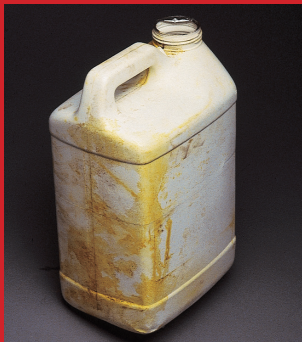
Dried formula on container