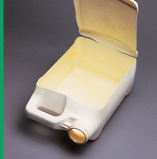
Inside stained but rinsed clean