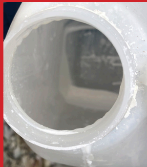
Dried formulation on thread