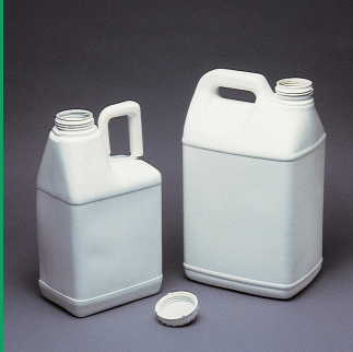
Container, thread, and lip are clean