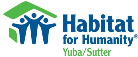
Habitat for Humanity Yuba/Sutter