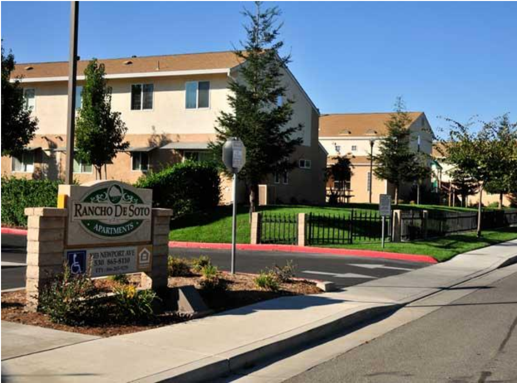
Rancho de Soto Apartments